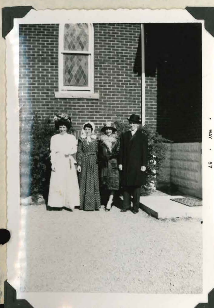
Program Committee, Garrison Road U.B. Church.