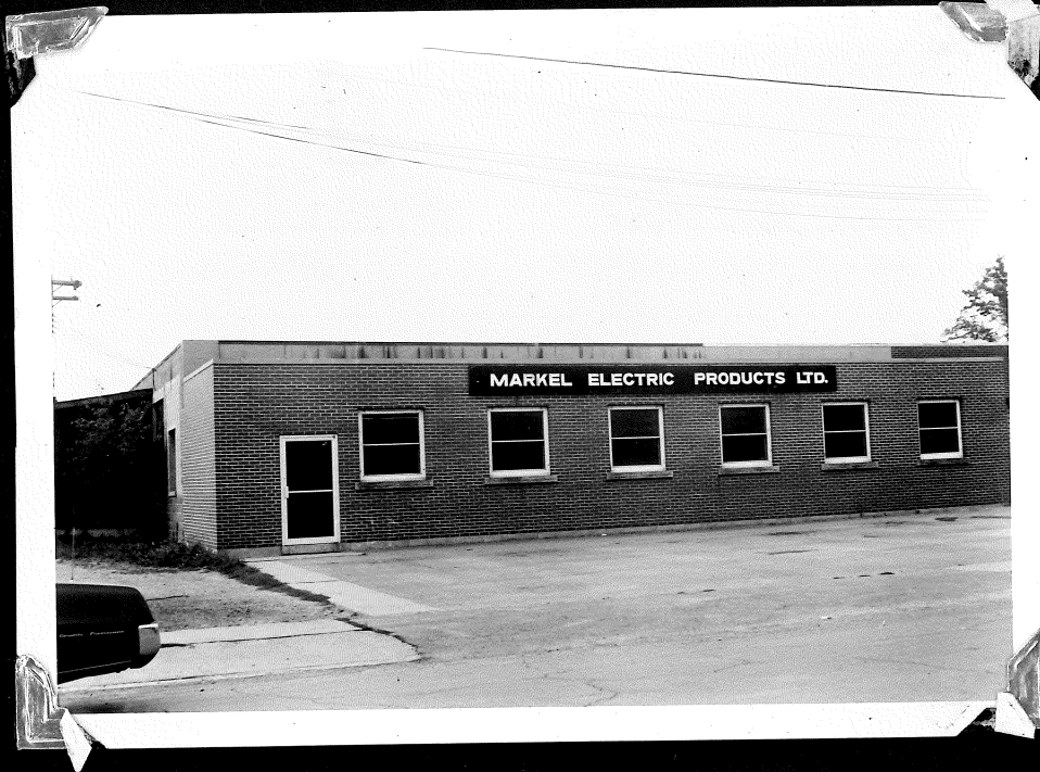
The Marcel Electric Bld. Courtwright St. Fort Erie.

The Company came to town in 1932. Pictured is their new office building, fronting the plant on S.S. of Lewis st.