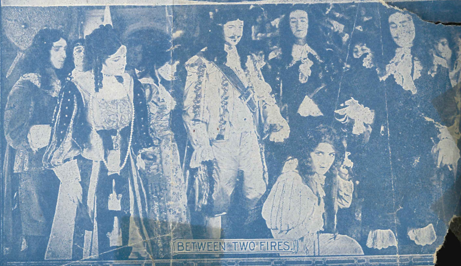
BETWEEN TWO FIRES