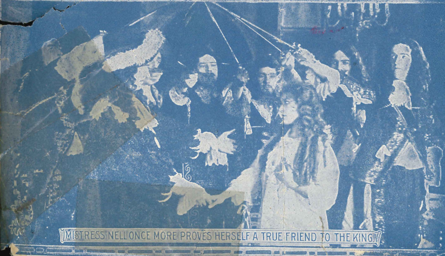
MISTRESS NELL ONCE MORE PROVES HERSELF A TRUE FRIEND TO THE KING