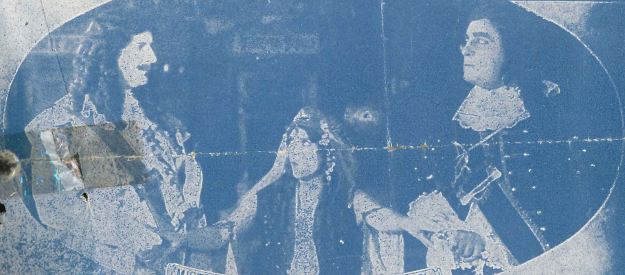
MISTRESS NELL PREVENTS A QUARREL